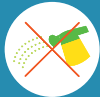
Reduce need for chemical fertilizers