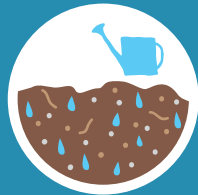
Improve water holding capacity in soil