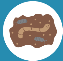
Build healthy soil