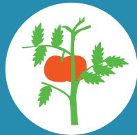
Grow your own food