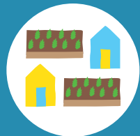
Keep resources local to your community