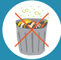
Reduce greenhouse gases