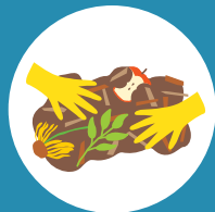
Compost together to build community