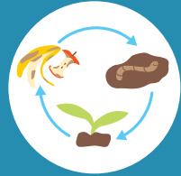
Reduce food waste